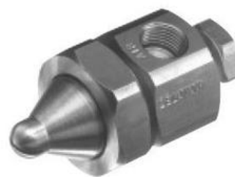
AL 90 FLAT SPRAY - INTERNAL MIX

The AL 90 series produces a flat fan spray pattern with siphoned or gravity fed liquid. Unlike other internal mix types the flow will remain relatively constant with an increase or decrease in air pressure. This allows the user to maintain constant flow rates and adjust atomisation with air pressure.