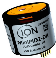
MiniPID 2 sensor