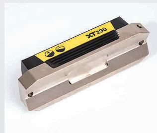
Precision ground prismatic base. Two holes for personal adaptations and brackets.