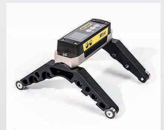
Legs for measurement on cylindrical surfaces with diameters larger than 55 mm. Accessory, Part No. 12-0901.

Easy-Laser® is manufactured by Easy-Laser AB, Alfagatan 6, SE-431 49 Mölndal, Sweden Tel +46 31 708 63 00, Fax +46 31 708 63 50, e-mail: info@easylaser.com, www.easylaser.com © 2020 Easy-Laser AB. We reserve the right to make changes without prior notification. Easy-Laser® is a registered trademark of Easy-Laser AB. Apple, the Apple logo, iPhone, and iPod touch are trademarks of Apple Inc., registered in the U.S. and other countries. App Store is a service mark of Apple Inc. Other trademarks belong to their respective owners. This product complies with: EN60825-1, 21 CFR 1040.10 and 1040.11. This device contains FCC ID: Q00BGM13P, IC: 5123A-BGM13P. Taiwan, ID: CCAM18LP1260T0. Documentation ID: 05-0976 Rev1