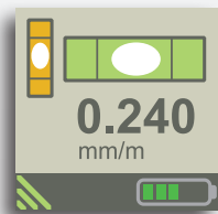
Clear display on XT290. Live values and graphics.

Align with live values, document as PDF. (XT Alignment app for iOS and Android. Values/Level program.)