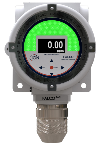
Diffused TAC (10.0eV) model