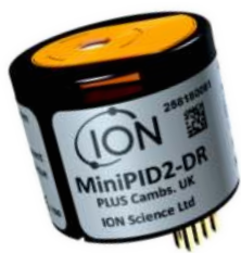
MiniPID 2 sensor